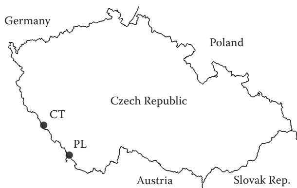
Fig. 1. Position of both studied localities in the Czech Republic: CT – Čertovo Lake, PL – Plešné Lake

The aim of this paper is to report the results of investigations on the biomass and nutrient pools of selected trees in the catchments of unique glacier lake ecosystems in the Bohemian Forest Mts. The chemistry and element fluxes of these lakes have been studied intensively for a long time. Many interesting results have already been published, but there are still some questions that have not been fully answered. Significant differences in the element concentrations and fluxes between the Plešné and Čertovo Lake were found in spite of similarities between these two lakes (KOPÁČEK et al. 2001a). Both lakes differ in trends of biological recovery after long-term acidification in the last century caused by air pollution (KOPÁČEK et al. 2002a; MAJER et al. 2003). To understand and explain these processes, detailed studies on lake and stream chemistry, atmospheric deposition, soil pools and biochemistry have been carried out in recent years. However, important components of the biogeochemical cycle such as nutrient pools stored in the forest stands have not been studied yet. This study should fill a gap in the present knowledge of nutrient pools and flows within the ecosystems of these glacier lakes.